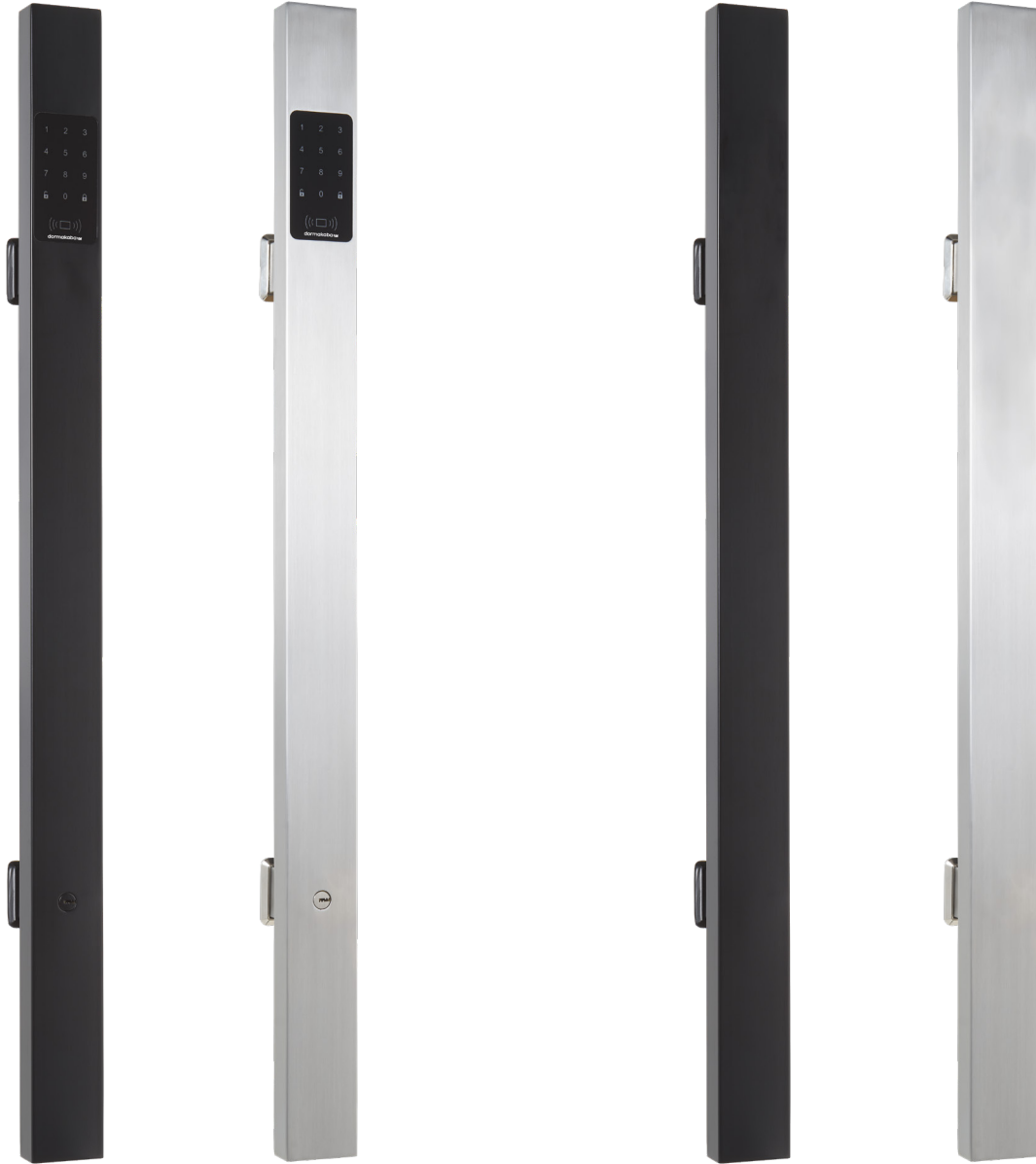
Entrance Pull Handles